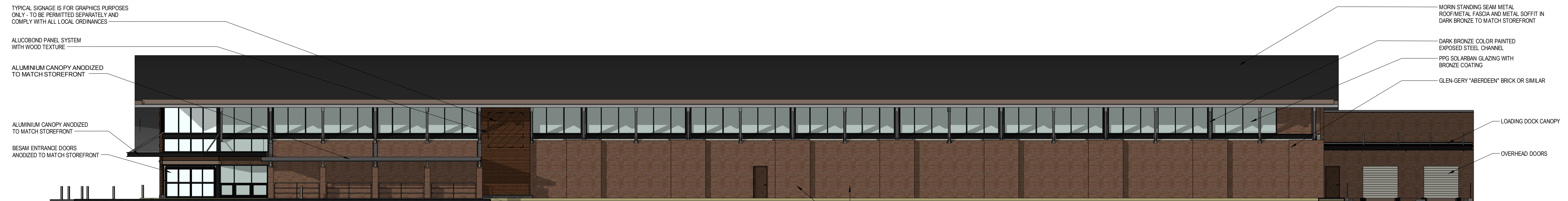
A1 PR-01 ELEVATION FACING GEORGE W. LILES PARKWAY 3/32" = 1'-0"

8'-0" 16'-0" 8'-0" 16'-0" 8'-0" WIDE X 1'-0" DEEP BUMP OUTS (TYPICAL) GLEN-GERY 'ABERDEEN' BRICK OR SIMILAR