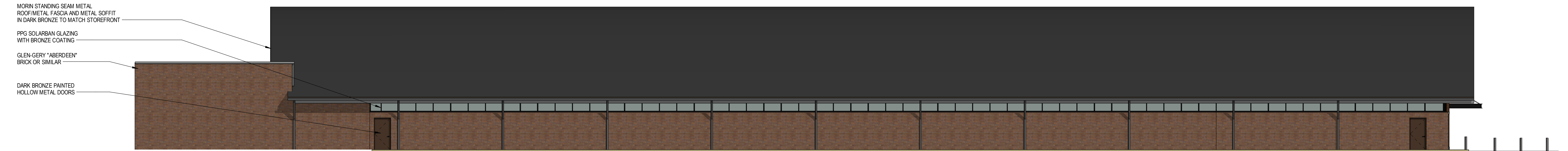
B1 PR-01 ELEVATION FACING RESIDENTIAL PLOTS 3/32" = 1'-0"